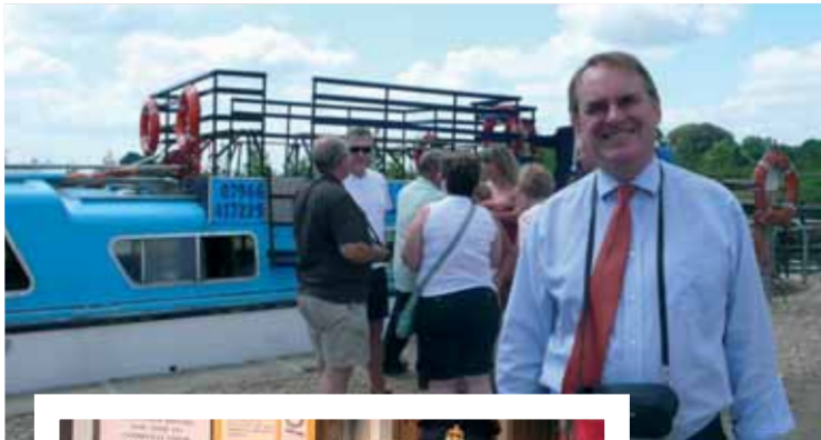
Re-opening of the Drifffield Canal