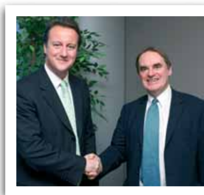
Rt Hon David Cameron MP and Timothy Kirkhope MEP

I will of course, continue to help you all in your Associations – we have a huge task ahead of us in 2010, and I will be with you every step of the way.