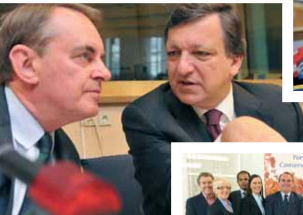
Discussing priorities with EU Commission President José Manuel Barroso