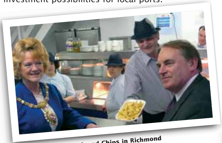
Fish and Chips in Richmond